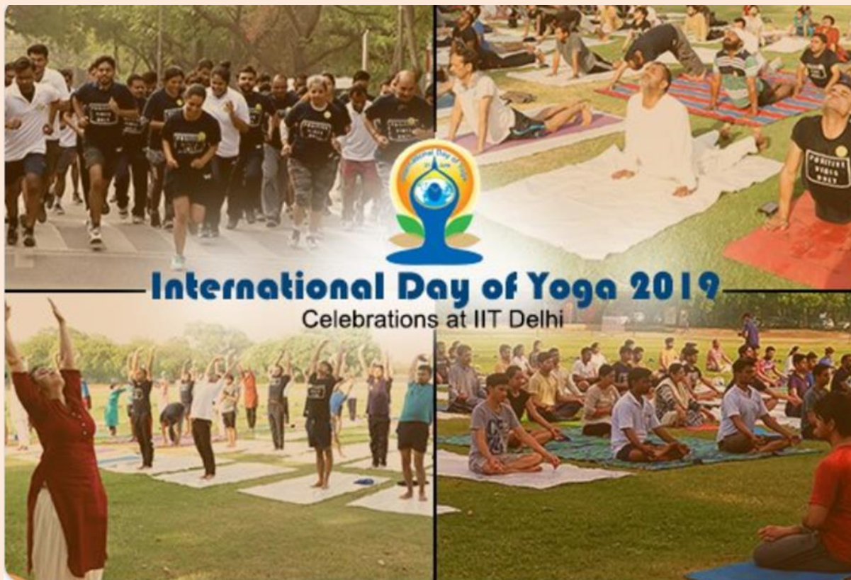
Yoga Day celebrations at IIT Delhi Image Credit: (@iitdelhi)

June 22, 2019 https://www.devdiscourse.com/article/education/569612-iitd-organised-yoga-sports-competitions-on-yoga-day