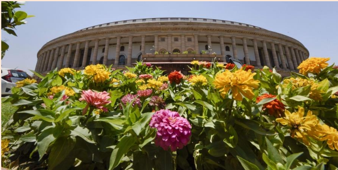
A view of Parliament House, in New Delhi, Tuesday, May 28, 2019.

The alumni and students, under the banner of the IRSC (Solve), work with the aim of reducing the number of road accidents by half by 2030.