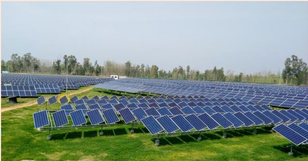
All 3 types of fixed, single-axis and 2-axis trackers at site location for collecting the live data; 60 kW SMA make inverters and PV panels from Renesola used for the PV project installation

Pitched as a solution between dual-axis and single-axis trackers, the 2-axis solar tracker offers a yield increase comparable with dual-axis trackers at a significantly lower cost.