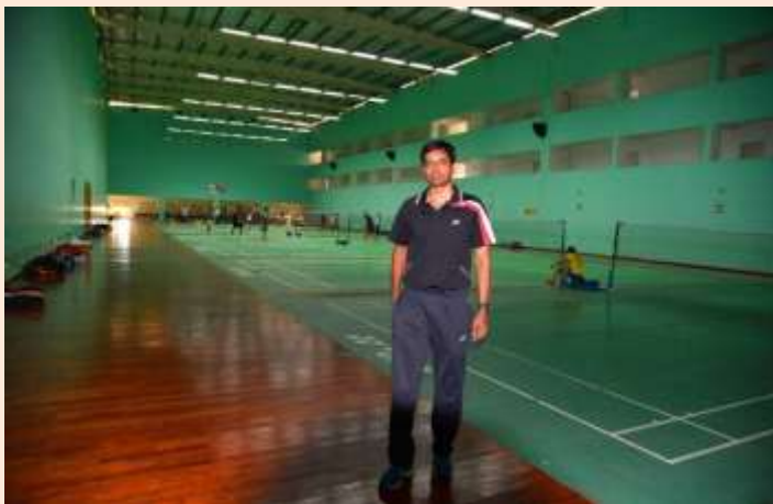
India's chief national coach Pullela Gopichand at the Gopichand Academy.

Under the collaboration, IIT-KGP will also set up a sports academy in collaboration with Gopichand.