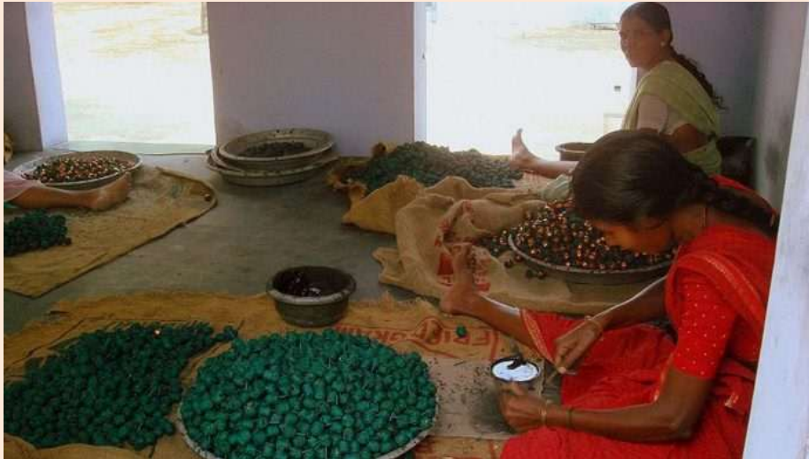
Workers in a fireworks factory in Sivakasi

The toxic chemicals whose manufacturing brought the environmental spotlight on Tamil Nadu's Sivakasi may just help transform the city's fortunes after all — with some help from the IIT Madras, the Indian Space Research Organisation and the Tamil Nadu government.