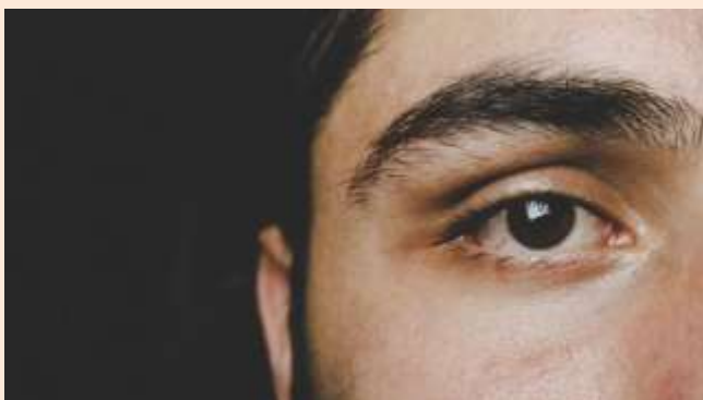
Scientists from IIT Gn develops a tool to identify dementia through eye movements

By the time symptoms of dementia are detected, it is too late -- Alzheimer's disease kicks in and it can't be managed. But if dementia is caught early, we can delay the progression of Alzheimer's.