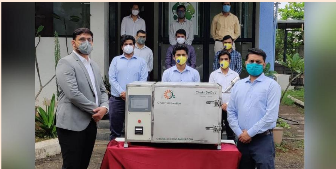
Officials of Chakra Innovation with Chakr DeCoV device.

According to the IIT, the device can kill up to 99.99 per cent of bacteria and virus in the mask.