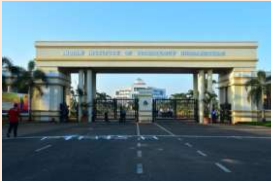
Indian Institute of Technology, Bhubaneswar

https://www.theindianwire.com/education/iit-bhubaneswar-partners-with-aots-japan-118817/