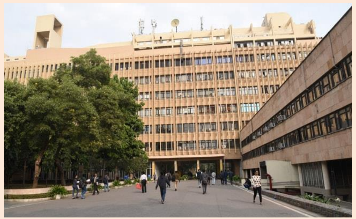
COVID-19: IIT Delhi institutes Benevolent Fund to help people of the lower economic strata within campus

Indian Institute of Technology (IIT) Delhi has institutes the IIT Delhi Benevolent Fund to receive voluntary contributions in a formal and transparent manner for meeting the needs of the people of the lower economic strata that depend on the campus community.