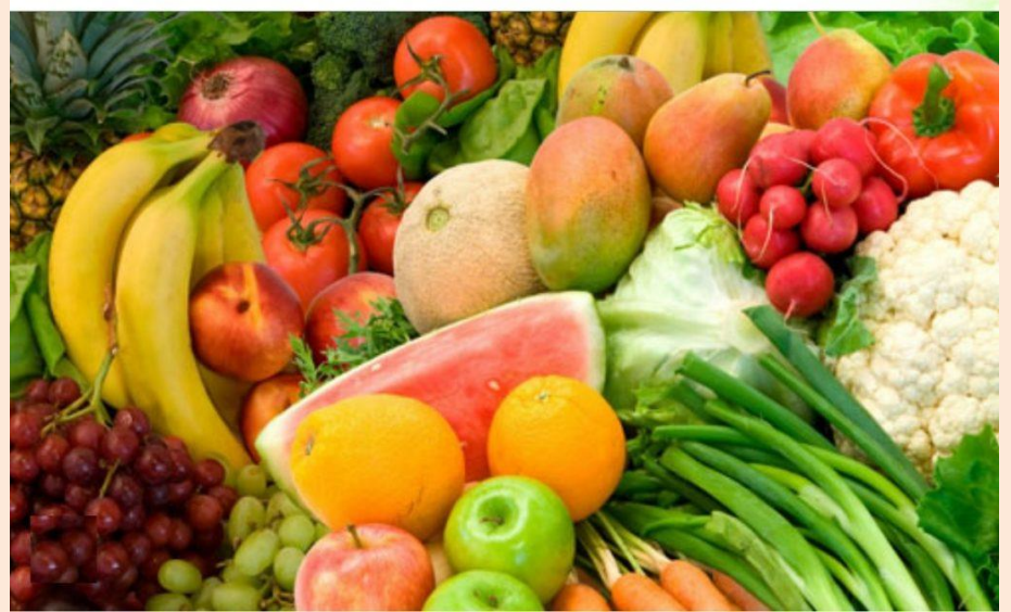
APEDA Signed Signs MoU with IIT Delhi, QCI, ICFA, SGT University and Pearl Academy

Further, efforts will be made to develop cost and energy-efficient farm machinery and tools by sharing laboratories for research. Also, the collaboration will work on developing protocols for exporting horticulture produce to distant international markets through sea route.