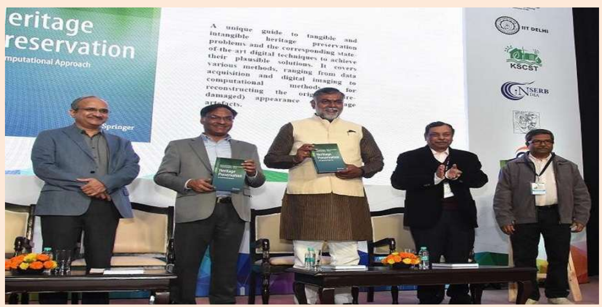
Minister of Culture and Tourism, Prahlad Singh Patel launched two edited books on Digital Heritage

January 16, 2020 <a href="https://news.careers360.com/iit-delhi-shows-technology-interventions-for-heritage-preservation">https://news.careers360.com/iit-delhi-shows-technology-interventions-for-heritage-preservation</a>